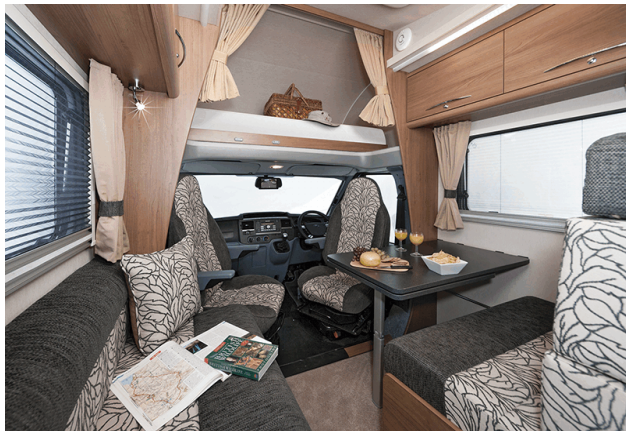
Front facing belted seats