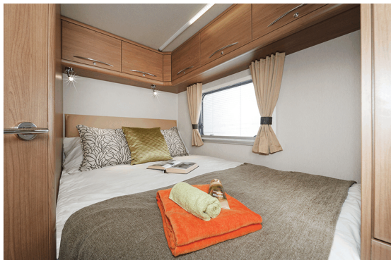
Rear Fixed Double bed